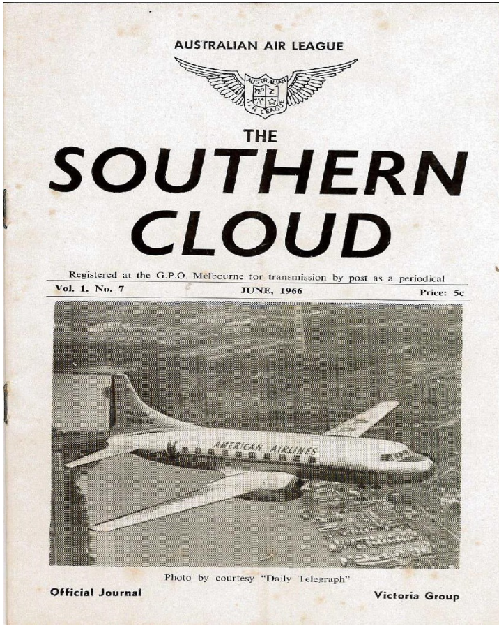
June 1966, Vol 1, No. 7