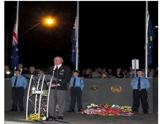
Cranbourne Squadron, 2018

Australian Air League collectively is asking that you all #STANDTO.